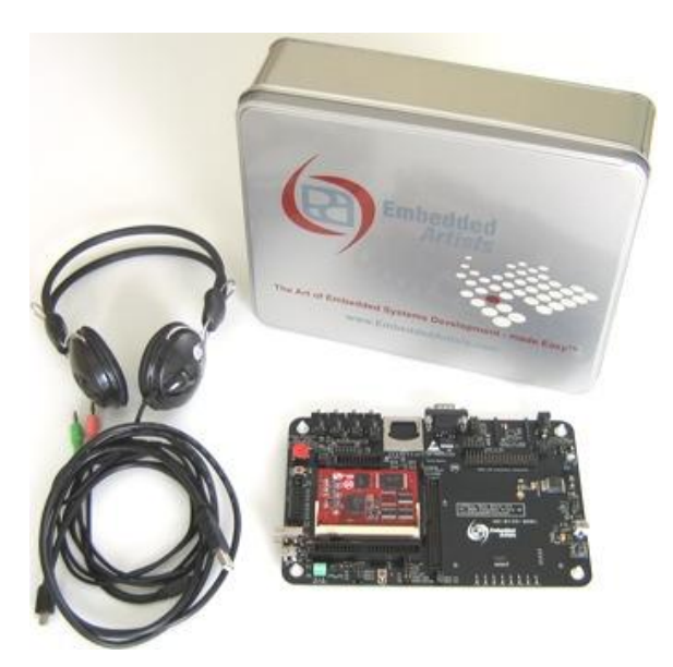
Figure 1 – Typical Developer's Kit Content

The typical development flow to integrate an OEM Board into a target system is as follows: